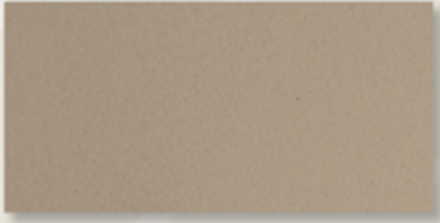
4. Sunset Beach Beige