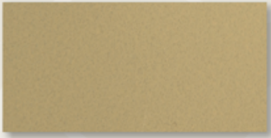
7. Russian River Gold