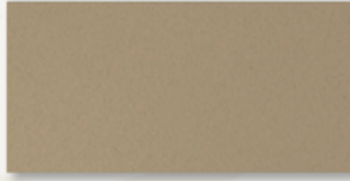
5. Tamalpais Tan